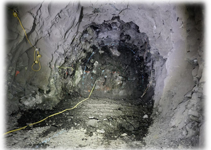
Right: West tunnel heading