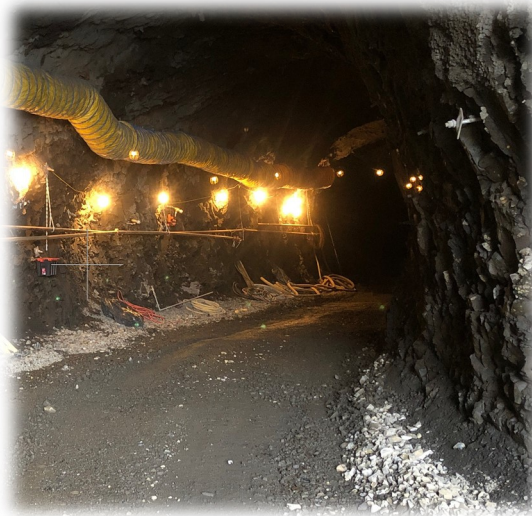
Left: East tunnel lighting