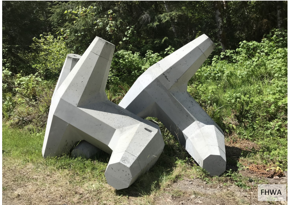
Log bundles will be chained to these concrete dolos and the assembled units will be used to create the Engineered Log Jams