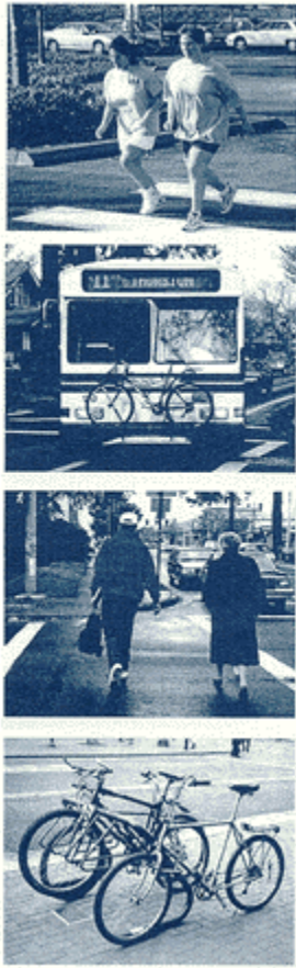
Figure 1. Photos of people running, a bus with a bike loaded on front, pedestrians and bicycles