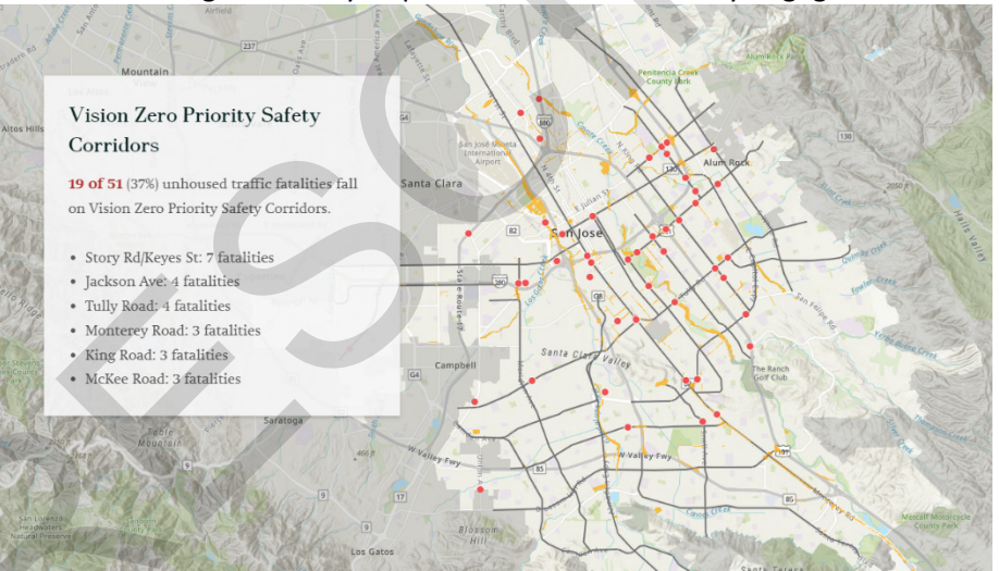
Figure 2 A screenshot from the City of San José's StoryMap depicting fatalities among people experiencing homelessness