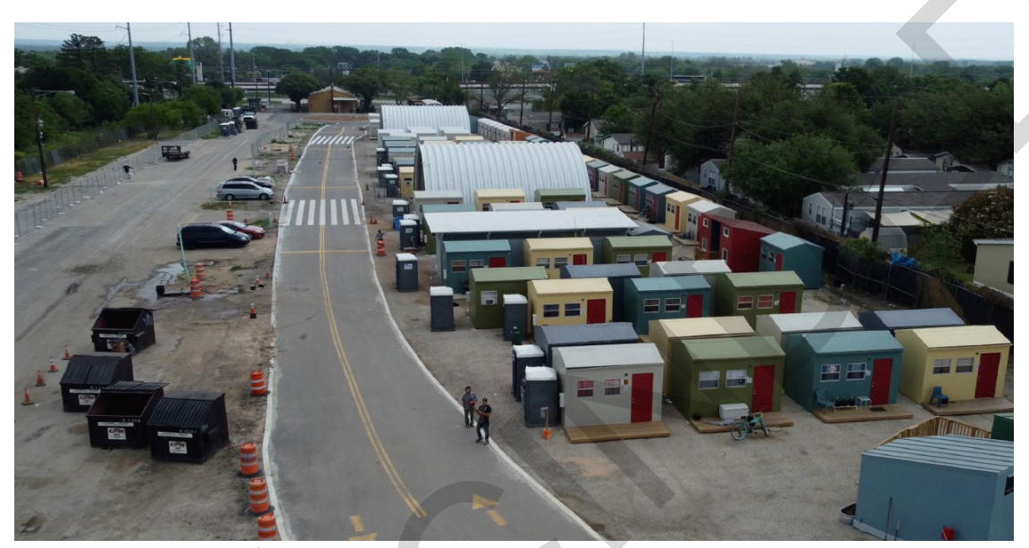
Figure 3 An aerial view of the locking, climate-controlled shelters at Esperanza Community

Recognizing that people experiencing homelessness made up 80% of fatalities and serious injuries from crashes along I-35 and that upcoming construction would displace encampments on I-35, TxDOT's Austin District recognized that it needed to come up with a meaningful and effective solution to address the needs of people experiencing homelessness. Through a coordinated approach with public, philanthropic, and private organizations, TxDOT proposed a transitional camp concept that would bridge the gap between unsheltered homelessness on the highway and ultimate permanent housing in line with a housing first approach. Leadership buy-in was achieved due to a clear transportation use case—pedestrian safety and displacements.