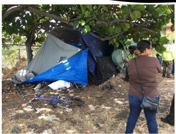
Figure 4 Hawaii DOT staff and contractors engage with people experiencing homelessness to understand their needs and connect them to services. When removing an encampment is necessary, they give people time to pack their belongings and provide storage for their belongings.