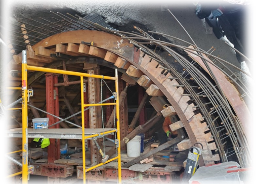
(All images) Source: FHWA