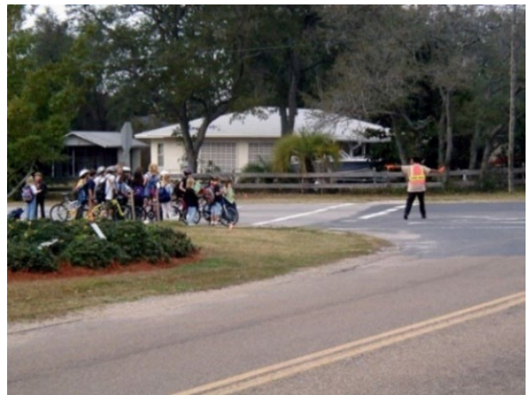
Children are vulnerable road users waiting at a crosswalk.

The North Jersey Transportation Planning Authority sponsors <u>walkable community workshops</u>. The workshops train participants to