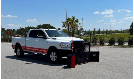
Automated debris removal system.

Video-sharing technologies allow cameras mounted on service patrol vehicles to stream images from incident scenes to transportation management centers (TMCs), as well as allow responders to view TMC images. Sharing video enhances the ability of responders and TMC operators to evaluate incidents, plan their responses, and identify the need for additional resources.