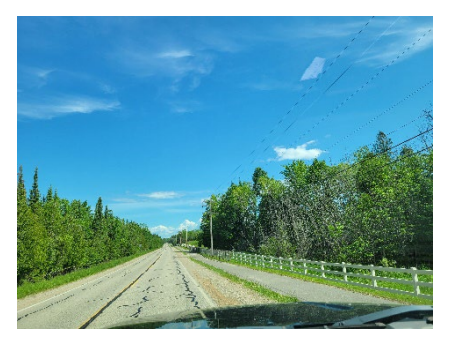
Hannahville Indian Community pedestrian infrastructure on Hannahville Road. Completed in 2018 with a TTPSF Grant of $746,495.

The TTPSF was developed to reflect feedback from Tribal transportation leaders. As a result, Tribes can