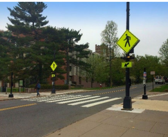
High-visibility crosswalk.

Available tools include <u>Proven</u> <u>Safety Countermeasures</u> and products, such as those championed by FHWA's <u>Safe</u> <u>Transportation for Every</u> <u>Pedestrian</u> and <u>Focus on</u> <u>Reducing Rural Roadway</u> <u>Departures</u> initiatives, as well as updated and new tools for lighting design and application of traffic control devices. While many agencies are already using some of these countermeasures, added benefits could be realized through