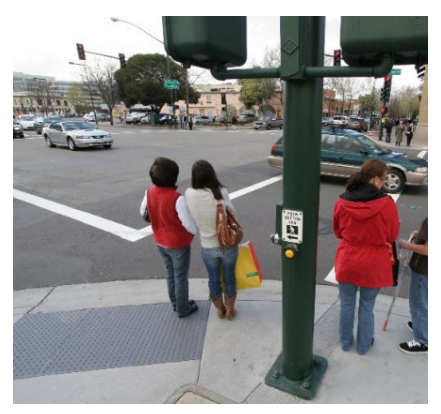
Pedestrians waiting at a crosswalk.

A common theme across these examples is that each agency uses multiple approaches to gather input. This emphasizes the importance of establishing a process for consulting with local governments and other stakeholders that represent the highrisk areas identified through the Vulnerable Road User Safety Assessment. The FHWA Office of Planning <u>website</u> outlines a step-bystep process to support the design of a public involvement program, which may be helpful to States as they