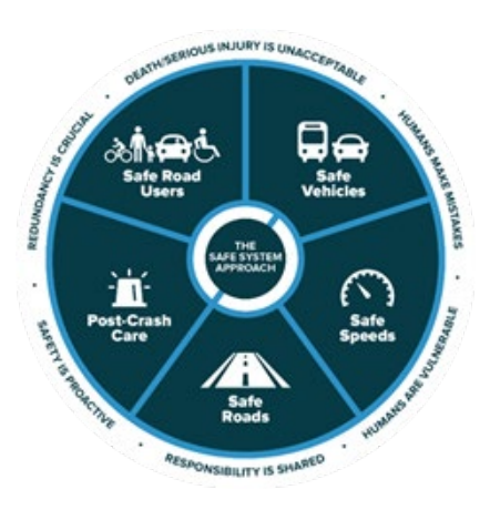
Safe system approach diagram.

technology can play a role in improving road safety.