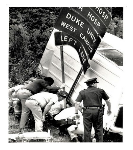
First Responders at the crash.

"I was knocked unconscious immediately. If my friend had not witnessed the crash while driving behind me, I would have no idea what happened."