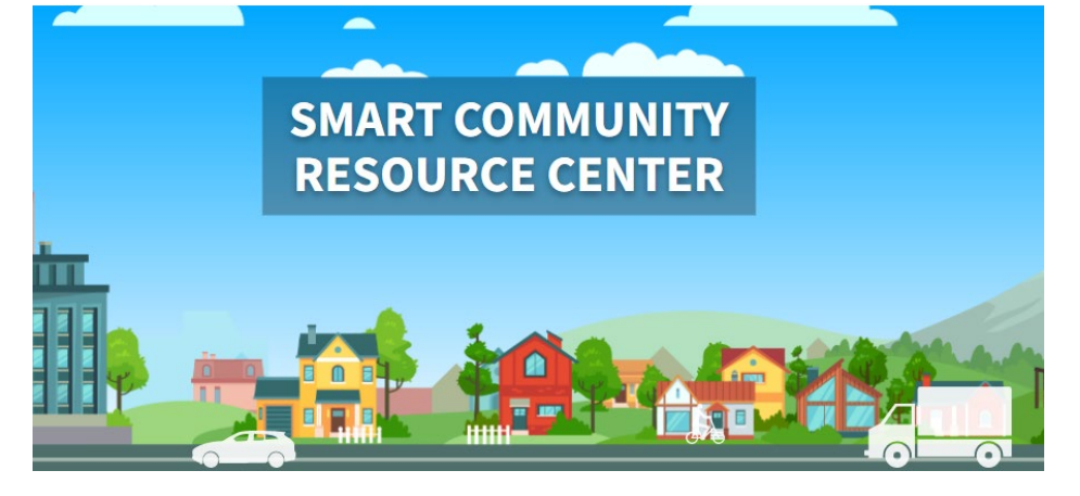
Smart Community Resource Center webpage.

So, is technology going to solve all our road safety challenges? We know there is no single solution but deploying safety technologies will be critical to our success in