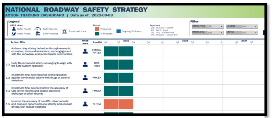
NRSS dashboard.

be asking: What steps is USDOT taking to implement the NRSS?