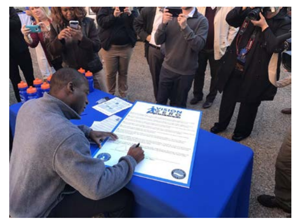
Richmond Major Levar Stoney officially makes Richmond, Virginia, a Vision Zero city.

Embracing the goal of eliminating traffic deaths, Mayor Levar Stoney signed a pledge to make Richmond, VA, a <u>Vision Zero city</u> on October 27, 2017. That commitment puts the city in alignment with others striving to dramatically reduce and even eliminate traffic fatalities and severe injuries by 2030. The City's Safe and Healthy Street Commission is charged with developing the Vision Zero plan and plan to have it complete by February 2018. This commission is multidisciplinary with active participation from the police department, public health, engineering and active citizen involvement.