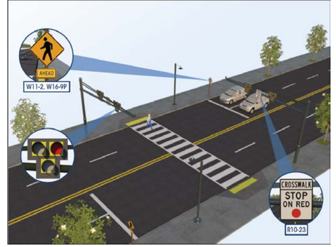
Figure 1. Pedestrian hybrid beacon tech sheet rendering.

Each tech sheet also provides helpful graphics, such as the rendering of a PHB installation shown in Figure 1, which includes an advance stop bar and warning sign, overhead lighting placed before the crosswalk, and the beacon head. Other countermeasure renderings show options for parking restrictions, curb extensions, bicycle lanes, and other roadway design features. Agencies can