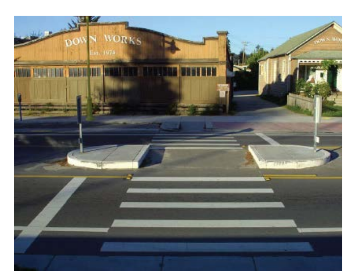
Example of a pedestrian refuge island.

These communities range in size from 8,000 to 850,000 residents. Regardless of size, however, they all offer examples of how to make streets safer for pedestrians. For example: