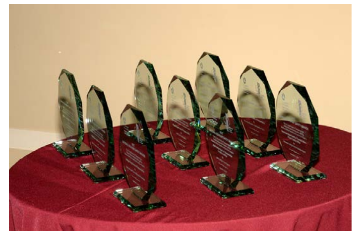
The 2017 Roadway Safety Awards.

Delaware's Systemic Safety Improvements Using High-Friction Surface Treatment . Roadway departures account for nearly 40 percent of Delaware's fatal crashes, and of these, half occur on curves. Focusing on roadway departure crashes on