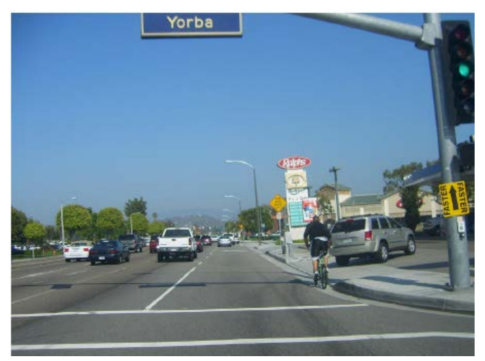
Multilane roads developed to prioritize automobiles often lack appropriate bicycle facilities. As speeds and volumes increase, a simple shared lane does not provide bicyclists with a comfortable, safe option.

Accordingly, the Office of Safety has revised and re-issued the guide entitled <u>How to Develop a</u> <u>Pedestrian and Bicycle Safety Action Plan</u>, which is aimed at helping State and local officials decide where to begin to address pedestrian and bicycle safety issues. The newly updated guide, issued in the fall of 2017, is designed to help agencies enhance existing safety programs and activities, including identifying safety problems and selecting optimal solutions. The guide also serves as a reference for improving pedestrian and bicyclist safety through a multidisciplinary, collaborative approach to safety that includes enhanced street designs and countermeasures, policies, and behavioral programs. Engineers, planners, safety