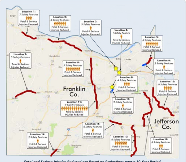
Fatal and Serious Injuries Reduced are Based on Projections over a 10-Year Period.

Missouri's "Road to Saving Lives" Design-Build Project . Searching for an effective way to implement its zero deaths strategy, MoDOT's St. Louis District identified 31 locations with the highest safety concerns in 2 counties and invited 5 teams to propose ways to address these locations. For this invitational bid, MoDOT chose a design-build procurement format that emphasized cost-effective safety treatments based on Highway Safety Manual analyses. The chosen team targeted safety improvements at all 31 locations and included a systemwide application of high-friction surface treatment, inlaid pavement markers, transverse rumble strips, LED stop signs, an intersection conflict warning system, and a roundabout. Over a period of 10 years, the project is expected to prevent 73 fatal and serious injury crashes.