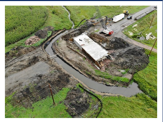
© 2019 Minnehaha County Highway Department.