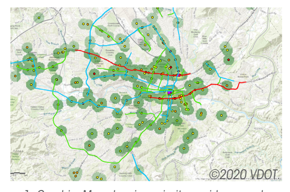
Figure 1. Graphic. Map showing priority corridors, crashes, and crash clusters in Roanoke, Virginia.<sup>2</sup>