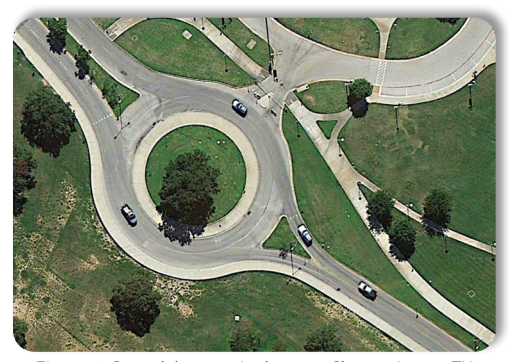
Figure 2: Roundabout at Auditorium Shores, Austin, TX

Before the briefing, ATD staff provided handouts and other materials to attendees to supplement the formal presentation. As attendees arrived, consultants played a video that highlighted geometric and operational characteristics of roundabouts, comparisons to traffic circles, and methods for all road users to traverse a roundabout. The video and handouts introduced attendees to the basics of well-designed modern roundabouts and their benefits before the actual briefing began.