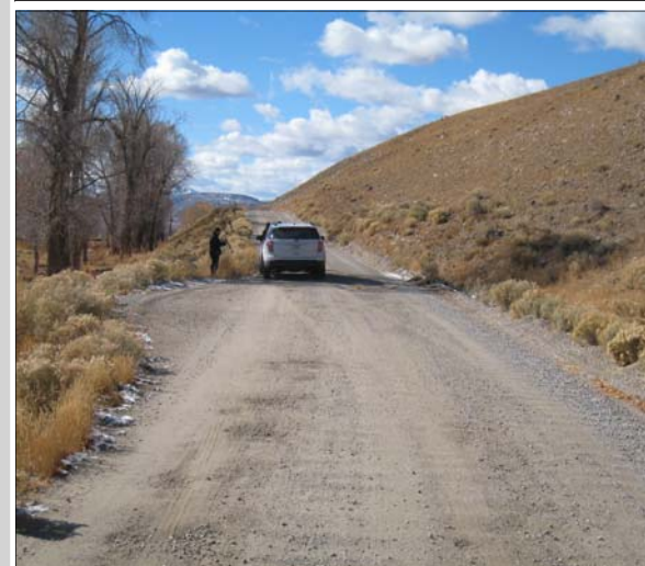
National Elk Road, Pre-Construction