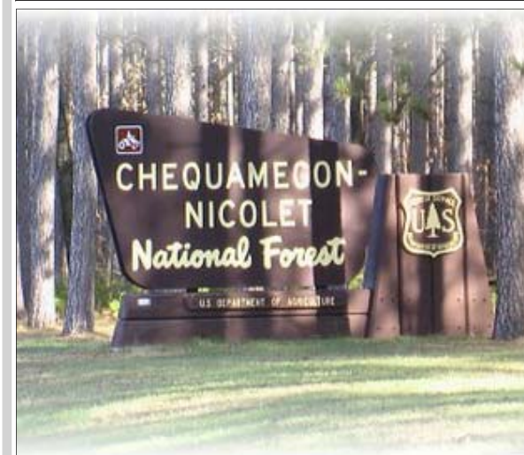
Chequamegon-Nicolet National Forest entrance, WI