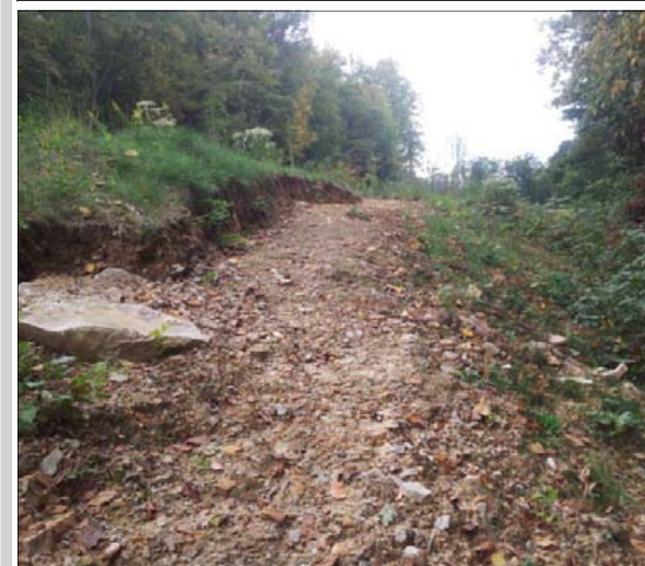
Piney Creek Trail, WV