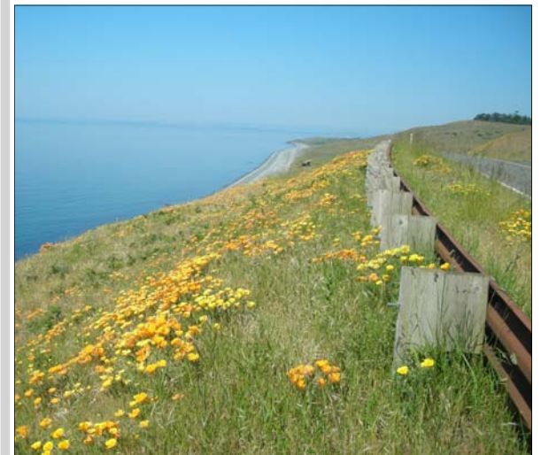
Cattle Creek Road, San Juan Island, Washington