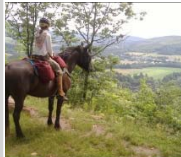
View from Mt. Thom