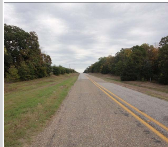
FM 409 Rehab Widening Project, Pre-Construction