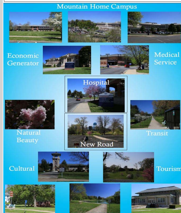
Veterans Affairs Hospital Connector, Tennessee