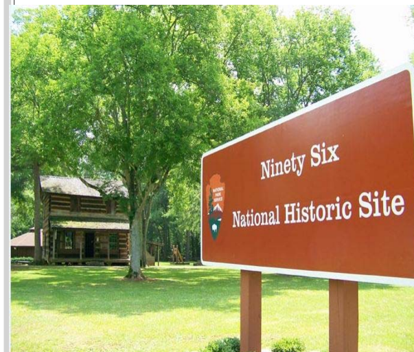
Ninety Six National Historic Site NPS, South Carolina