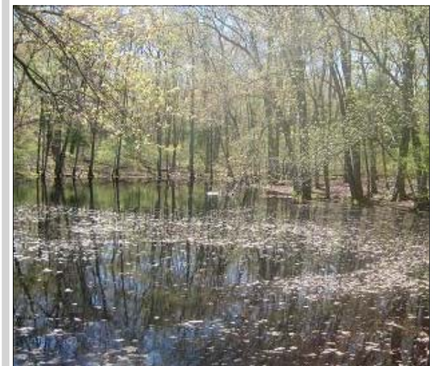
View of the Ninigret National Wildlife Refuge