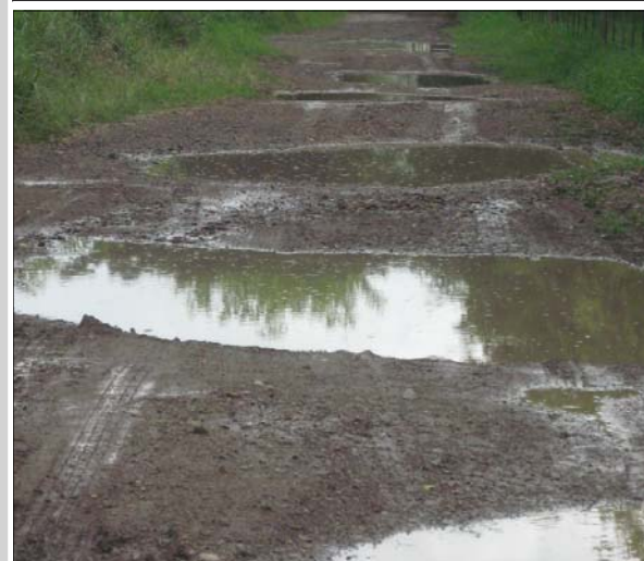
Current Condition of the Access Rd to Laguna Cartagena NWR