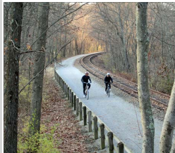
Heritage Rail Trail, York County, PA