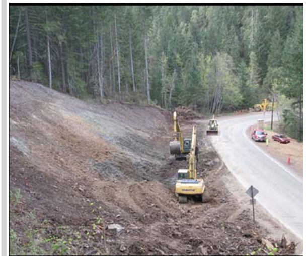
Tiller Trail Highway, Douglas County, Oregon