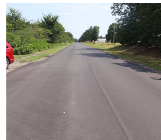
Belle Star Park Road