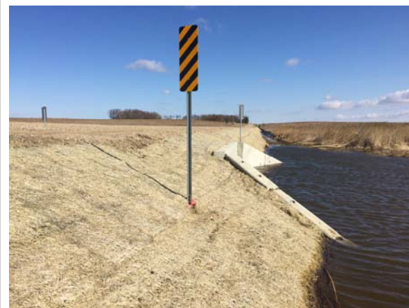
Box Culvert at Brecker