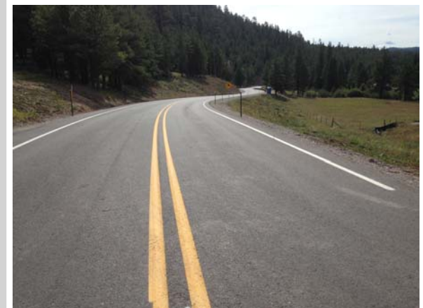
Cuba la Cueva