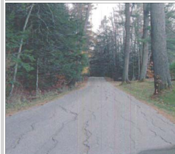
Current View of Saint Gaudens Road