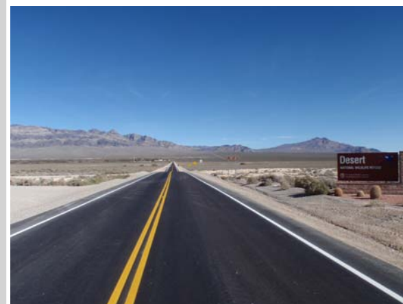
Corn Creek Road