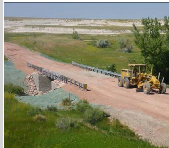
Sand Creek Bridge, During Construction