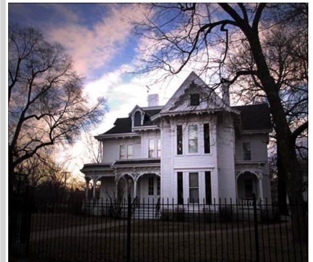
Harry S Truman National Historic Site, Grandview, MO