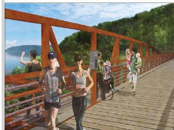
MISSISSIPPI RIVER REGIONAL TRAIL SPRING LAKE PARK RESERVE