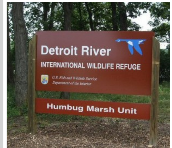
Detroit River International Wildlife Refuge's entrance, Michigan.