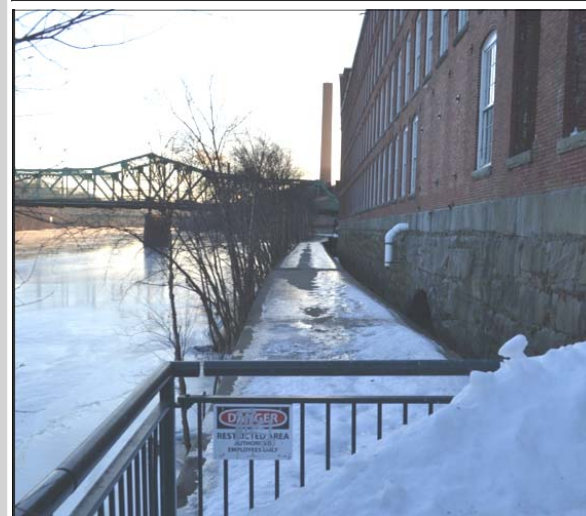
Current terminus of Lowell Riverwalk