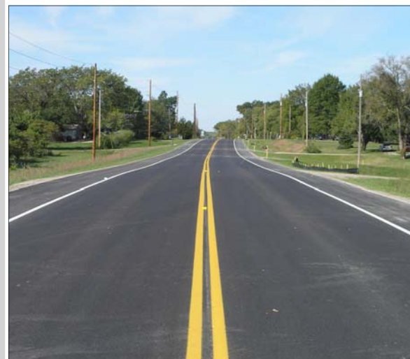
North 1200 Road Widening, Post-Construction