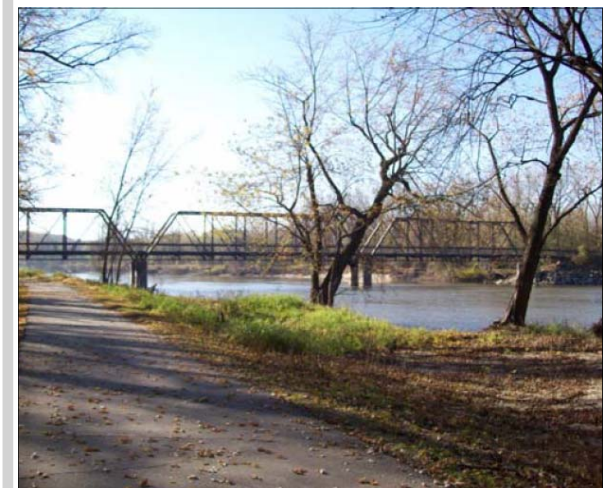
Scenic View of the river and historic InterUrban Trail Bridge from the Neal Smith Trail