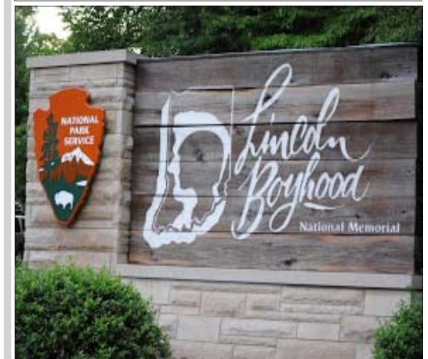
National Park Service's Lincoln Boyhood National Memorial entrance, Indiana.