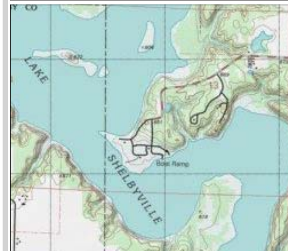
Wilborn Creek Recreation Area