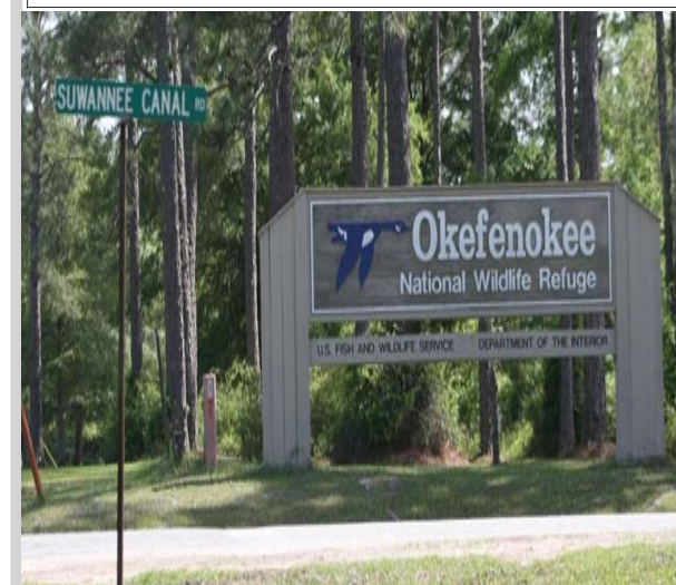
Okefenokee National Wildlife Refuge, Georgia