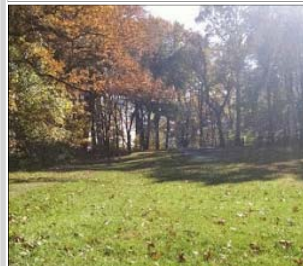
Metro Access Path on Galloway Street NW, Washington, DC