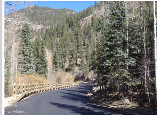
Guanella Pass Road