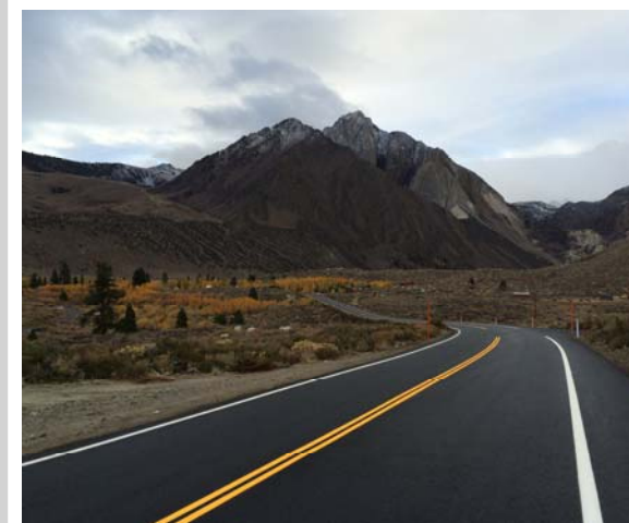
Convict Lake Road