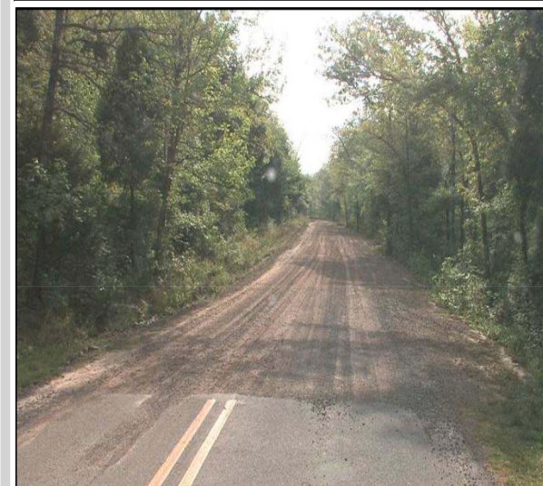
Highway 220 Crawford County, Arkansas

This project is the primary route for Ozark National Forest and will provide a safer more enjoyable access for visitor mobility to enjoy recreational opportunities at Devil’s Den State Park for fishing, hunting, camping, hiking, swimming, canoeing, mountain biking and horseback riding.