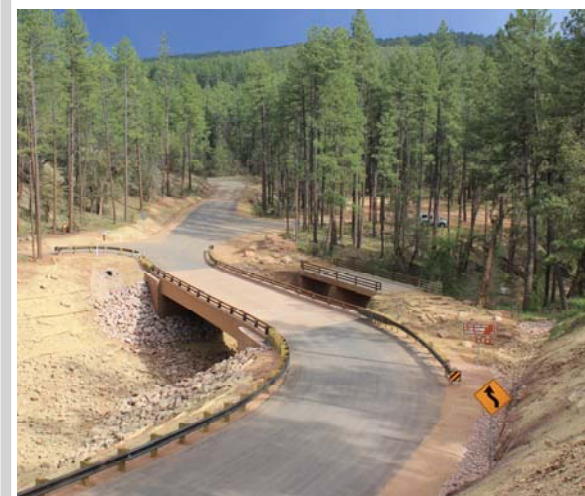
New bridge on Houston Mesa Road