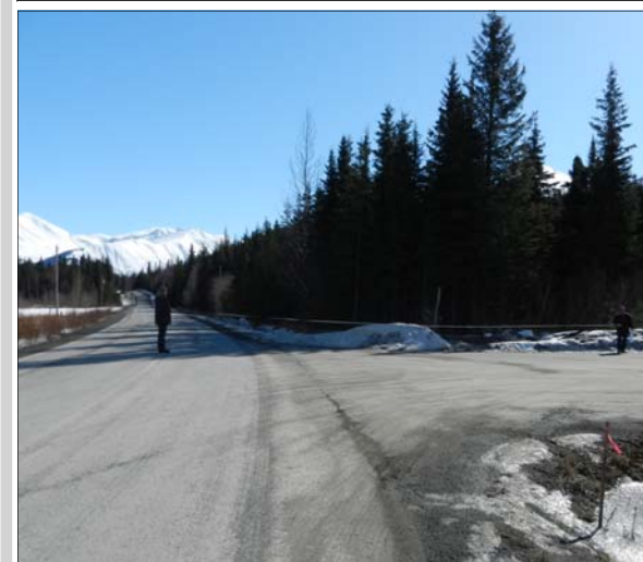
Snug Harbor Road, Kenai Peninsula Borough, Alaska