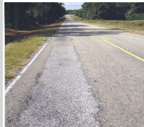
County Rd 700 surface, City of Enterprise, Alabama