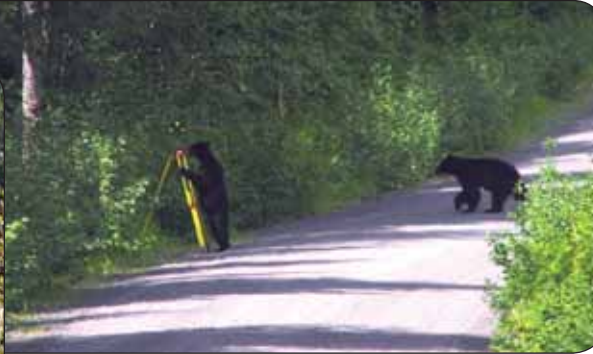
Image captured by WFL Lead Survey Technician, while working on a project near Kake, Alaska