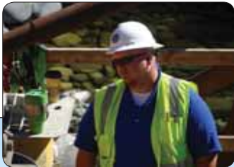
South Fork Smith River Bridge job site, California