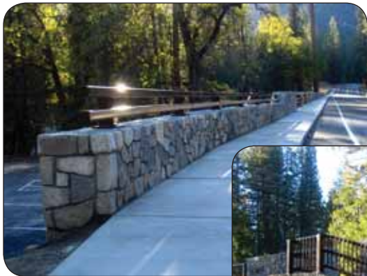
Views of stonework on Kings River Bridge, Sequoia National Park, California