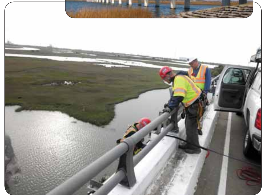
Inspection Team repels over the side of the Cat Creek Bridge — Wallops Island, Virginia

space effort, and other facilities on Wallops Island to the mainland Eastern Shore of Virginia.