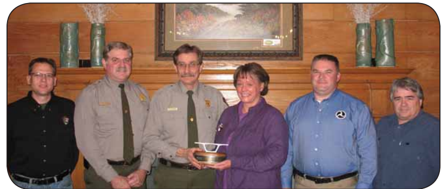
GRSM National Park Superintendant and EFL Division Engineer holding ASBI award flanked from left to right by NPS-Denver Service Center Project Manager, GRSM Chief of Facilities Management, EFL Director of Project Delivery and EFL Construction Operations Engineer.

Modern construction methods allowed this bridge to be constructed while “lying lightly on the land”, ensuring a product combining beauty and function to the great satisfaction of the NPS. The new bridge has an expected design life of 100 years.