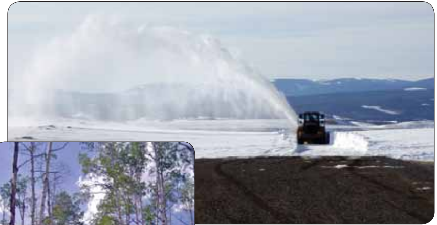
A glimpse of the beauty of the area — Aspen Alley, a gravel road near the Sierra Madre Mountains leading into Medicine Bow National Forest. The Sage Creek Road project provides access to this pristine site.

We successfully awarded the first construction contract in the country under the new FLAP program. The project, Sage Creek Road in Wyoming, was awarded in January 2013, in the amount of $14.50M and will improve approximately 27 miles of road. This segment completes the entire route which ultimately improved 43 miles of road. The project was accomplished with a loan/borrow from California FLAP to Wyoming FLAP in the amount of $4.4 million. The purpose of the project was to remedy existing roadway design, surface and drainage deficiencies to reduce maintenance costs, provide safe access, and promote recreation. Utilizing flexibilities established under MAP-21 and leveraging strong partnerships, everything came together in a structured, organized and systematic manner. This project also