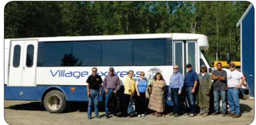
FLH Associate Administrator (4th from left) poses with FLH TTP staff, and the Manley Village Council transportation staff alongside the Village Express bus.

Minto Alaska is a small native village made up of Athabaskan Indians, unique because it is one of the few with road access. Having road access helps keep the cost of living down compared to other villages in Alaska. Although by comparison it is still much higher than most places across the US!