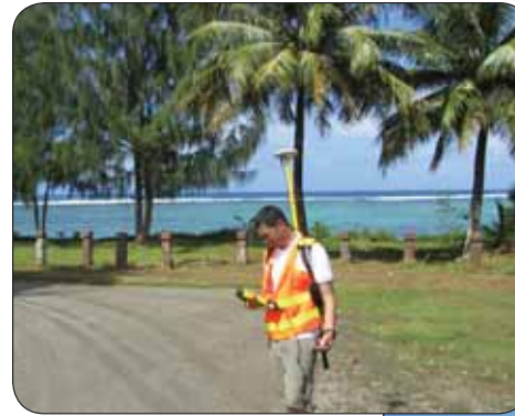
Haleakala National Park, Hawaii

The RIP Data Collection Vehicle (DCV) was shipped to the USVI in May 2013 to collect pavement condition data on the park roads at Virgin Islands National Park. (Shown here being transported by barge from the island of St. Thomas to St. John, white van center) The DCV collects video, GPS, and pavement cracking, roughness, and rutting information. Data was also collected during this trip on St. Croix' at Christiansted National Historic Site and Salt River Bay National Historical Park as well as on Puerto Rico at San Juan National Historic Site.