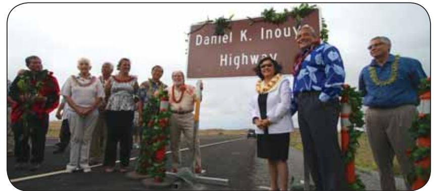
Ribbon cutting dedication held on September 7th, 2013 memorializing the late U.S. Senator Daniel K. Inouye with the renaming of the route in his name.

A major milestone was reached in the completion of Saddle Road along with Hawaii DOT and the Department of the Army Pohakuloa Training area. Saddle Road previously had the highest accident rate in the State of Hawaii. Improvements have resulted in enhanced economic benefit to the local communities by safely and efficiently providing access for cross island commuters and trade while also reducing travel time across the island. Many initiatives are to be highlighted on this project, including the use of innovative contracting, A+B bidding, alternate item bidding, a GRS-IBS Bridge Abutment, an option to use warm mix asphalt, as well as implementation of pavement Safety Edge.