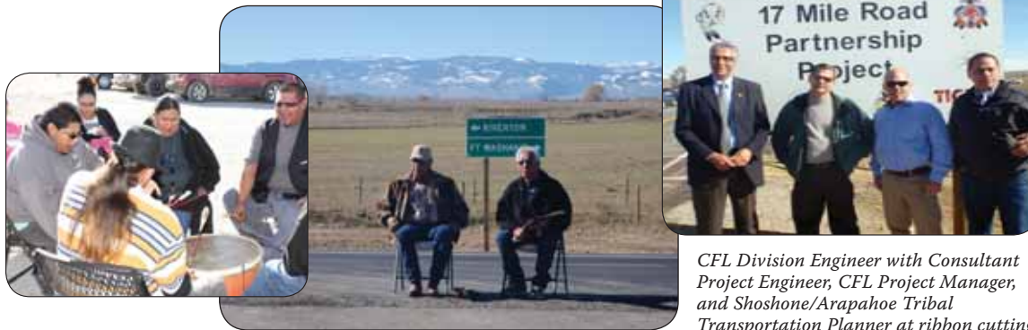
CFL Division Engineer with Consultant Project Engineer, CFL Project Manager, and Shoshone/Arapahoe Tribal Transportation Planner at ribbon cutting.

17 Mile Road, Wyoming, was built almost entirely by tribal workers of the Shoshone and Arapahoe Tribes, who were paid more than $3.7 million in wages for their successful efforts at improving “the most important road on the Wind River Reservation.” Prior to being rebuilt, 17 Mile Road was historically called one of the most dangerous roadways in Wyoming. The average fatality rate was twice the national average. Project completion was celebrated with a ribbon cutting and “cedaring”.