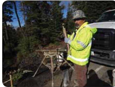
ERFO work, Walker Plains, Plumas National Forest, California