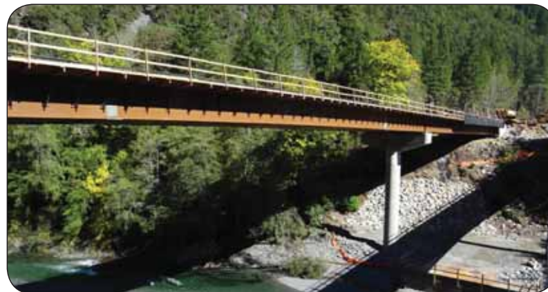
Bridge Replacement Project — South Fork Smith River Bridge, California