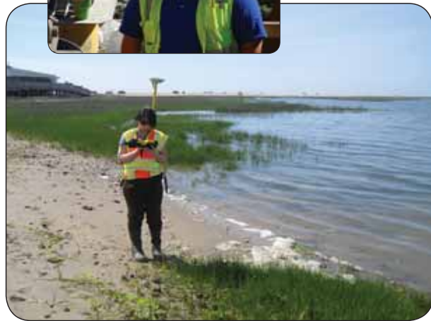
Data collection at Chincoteague National Wildlife Refuge, Virginia