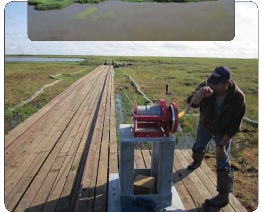
Tevyraq Railway Tram, 38 miles NW of Bethel, Alaska