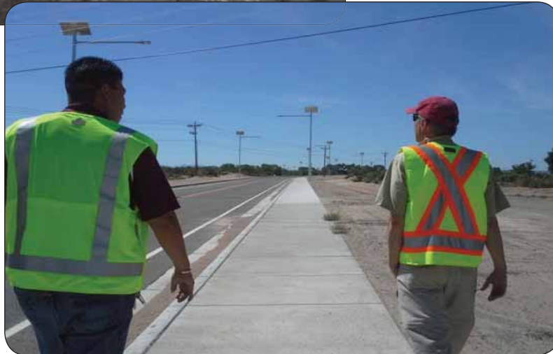
After — Ohkay Owingeh Public Works Director accompanies FHWA personnel during Final Inspection tour of the new all-weather surfaced road which now includes sidewalk, curb, gutter and solar lighting.