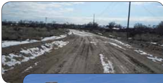
Before — North McCurdy Road, Ohkay Owingeh Pueblo (San Juan Pueblo) Indian Reservation, Espanola, New Mexico. A vital connection for the community, this road was subject to high accident rates and desperately in need of maintenance and safety improvements.

During 2013, FLH Leadership met with tribes in Arizona, New Mexico, North Carolina, and Alaska to listen to their concerns and issues. Progressive thinking and technical assistance to the tribes caused the BIA to add a government to government process to their portfolio, increasing the amount of funds that were actually obligated. This change may reduce the number of tribes coming to the FHWA umbrella, but it is enhancing the effectiveness of this program and increasing the amount of funds obligated during the Fiscal Year, a win for us and the tribes.