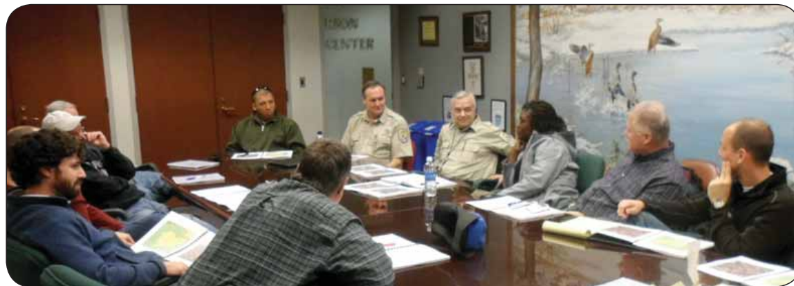
FLH personnel meeting with USFWS Regional Road Coordinators & Facility Managers at Patuxent Research Refuge to discuss verification of refuge road conditions and pavement recommendations system-wide.