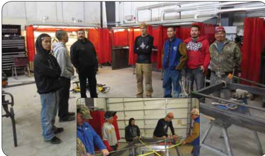
Trainees with AVCP Transportation Director (3rd from left)