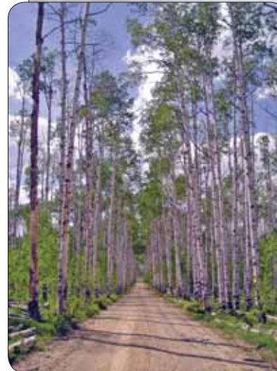
Sage Creek Road, Medicine Bow National Forest, Carbon County, Wyoming