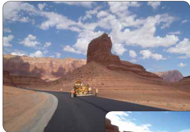
Lees Ferry, Glen Canyon National Recreation Area, Arizona — near the northernmost end of Grand Canyon National Park