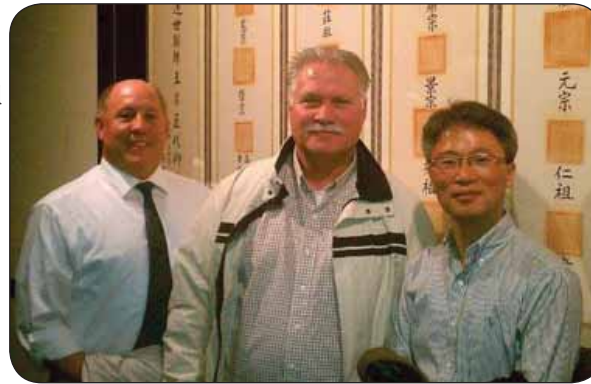
left to right: EFL FLAP Program Manager, FLH Transportation Performance Management Program Manager, Senior Manager Korean Expressway Corporation

FLH hosted a Korean engineer from the Korean Expressway Corporation on a rotational assignment. He was introduced to FLH Asset Management and saw how we used the data we have, to assist our partners in using the management systems.