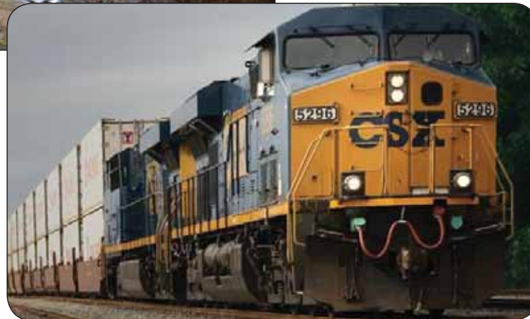
CSX double stacked container train — Baltimore, Maryland