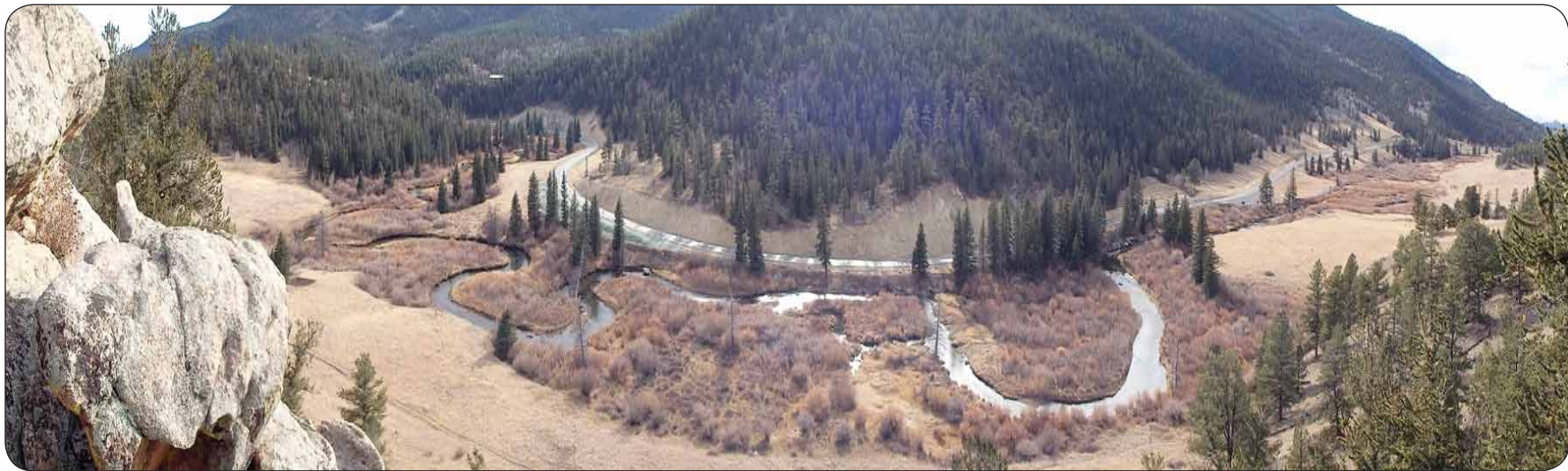
Tarryall Creek Road, Colorado

Now in its 31st year, the program and our role continue to expand and now includes more Federal partners and road networks. FLH expertise and credibility has grown to deliver a wider variety of transportation projects and improvements nationwide.