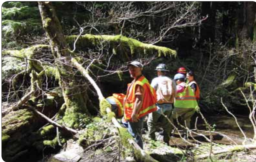
Hydraulics Team Site Assessment