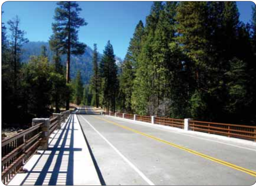
Kings River Bridge, Sequoia National Park, California