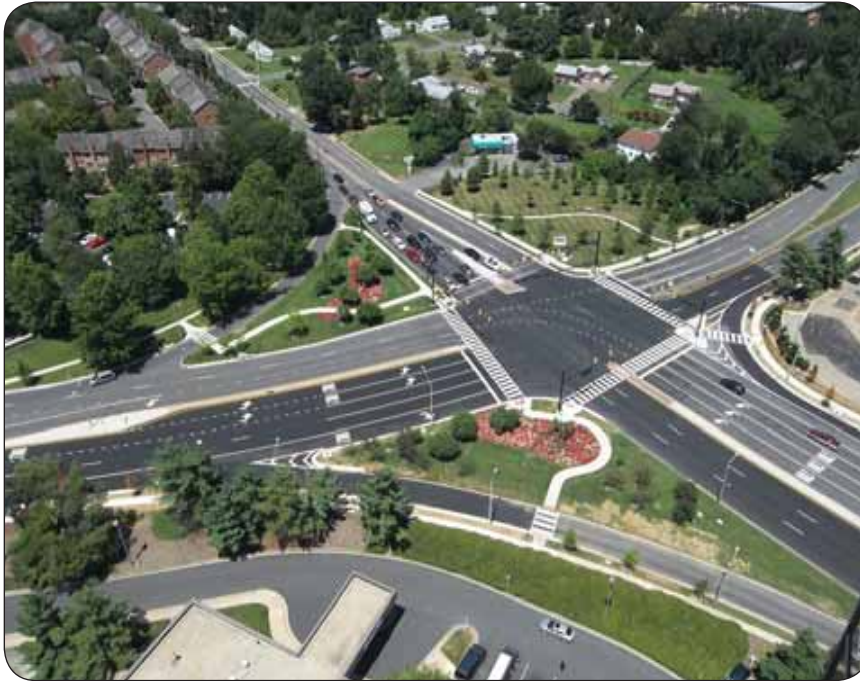
Improvements at 4 key intersections including modifications to surrounding I-395 general purpose ramps. — Mark Center, Virginia

FLH has been called upon to deliver projects for the military necessary to accommodate increased congestion due to relocations under the Base Realignment & Closure Act.