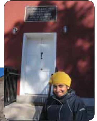
Assateague Lighthouse, Assateague Island National Seashore, Virginia

Half-day sessions are provided, up to 10 times per year, on a wide variety of topics including Life Planning, Emotional Intelligence, Resume Building and Interview Skills.