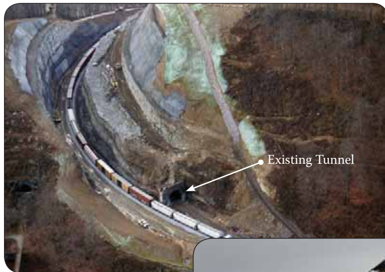
Train traffic continues to travel through the Pinkerton Tunnel Run-Around-Track while construction is underway to remove the existing tunnel. — Markelton, Pennsylvania

Full completion of Phase I, of the National Gateway Corridor Clearance Improvement Program has created a highly efficient rail system connecting Midwest producers and consumers with mid-Atlantic ports and world markets. Public funding for Phase One was supported by a federal TIGER (Transportation Investment Generating Economic Recovery) grant secured by the State of Ohio on behalf of the coalition, and administered by Federal Lands. Multiple agreements were required between the States in the Corridor (Ohio, Maryland, Pennsylvania, and West Virginia), FHWA, and CSX Railroad. Phase 1 will allow double-stack container trains to move between the Northwest Ohio Intermodal Terminal (North Baltimore, Ohio) and the newly opened intermodal facility in Chambersburg, Pennsylvania. In addition to spurring economic growth throughout the region, this project will double intermodal capacity along the existing corridor without increasing noise, emissions, or the number of trains. Various methods of gaining double stack clearances were used depending on the conditions and parameters of the site.