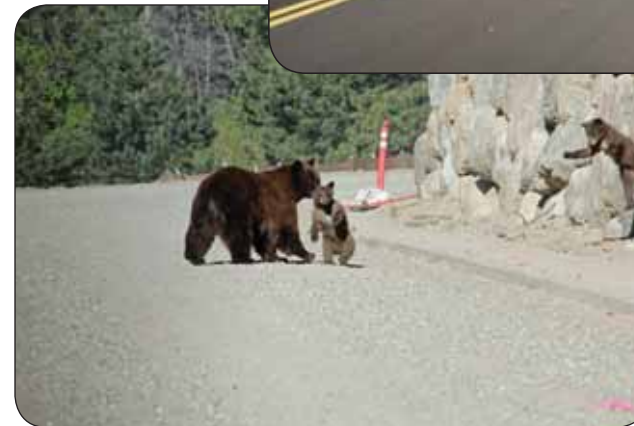
Rockery walls along Bear Lake Road — one of the most popular and heavily used routes in Rocky Mountain National Park, Colorado.