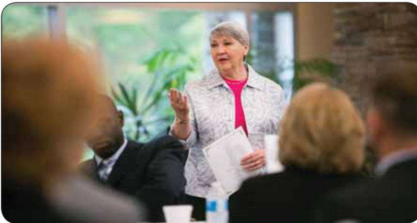
Instructor and creator of the LDA Program, speaking to a graduating class

The WFL class graduated on March 27, EFL's took place on April, 30.