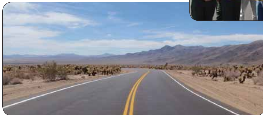
Pinto Basin Road Project, Joshua Tree National Park, California