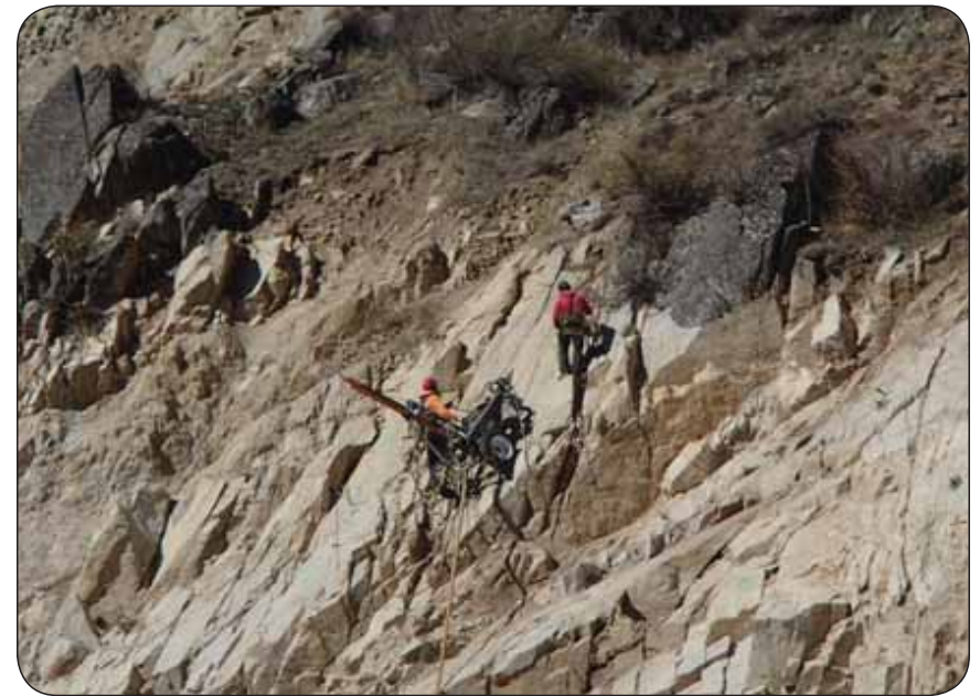
Rock bolt drilling and installation on Banks Lowman Highway, Southwest Idaho, Boise National Forest, an area of frequent, hazardous rockfall in cooperation with Idaho Transportation Department, and Boise County.

Rockfall mitigation designs include using integrally-colored concrete and a weathering stain (Natina) on steel components to help constructed elements blend into the surrounding materials.