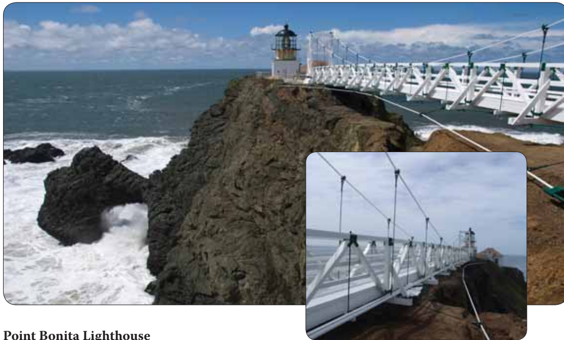
Point Bonita Lighthouse Golden Gate National Recreational Area, California

Recipient of the 2013 American Council of Engineering Companies of Colorado ACEC/CO Engineering Excellence Award