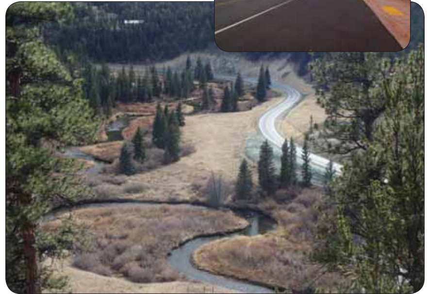
Tarryall Creek Road, Colorado