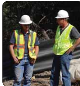
Trinity County Bridge, Shasta-Trinity National Forest, California