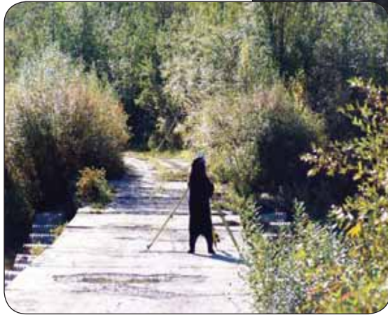
Survey crew gets assistance working on Ivar's Bridge, Fort Yukon, Alaska

Our employees are the most valued asset in our organization and we like to make sure they get all the help they need for continued success!