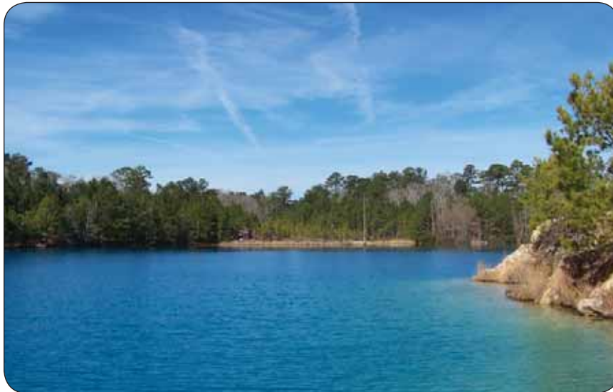
Angelina National Forest, Texas

FLH road condition assessments from Forest Highway Region 8 & 9 afforded the needed assistance in determining where to spend Forest Highway funds quickly & effectively. That data coupled with our