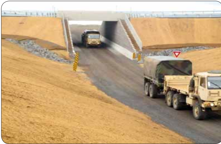
Bridge over Saddle Road constructed with GRS-IBS provides access for military operations to Pohakuloa Training Area, Big Island, Hawaii

We were selected as lead adopters for Rapid Renewal and Innovative Strategies for Managing Complex Projects under the Strategic Highway Research Program 2 (SHRP2) as well. We received funding to construct a replacement bridge using prefabricated bridge elements and systems (PBES) in the Seney River National Wildlife Refuge, Michigan and to develop design