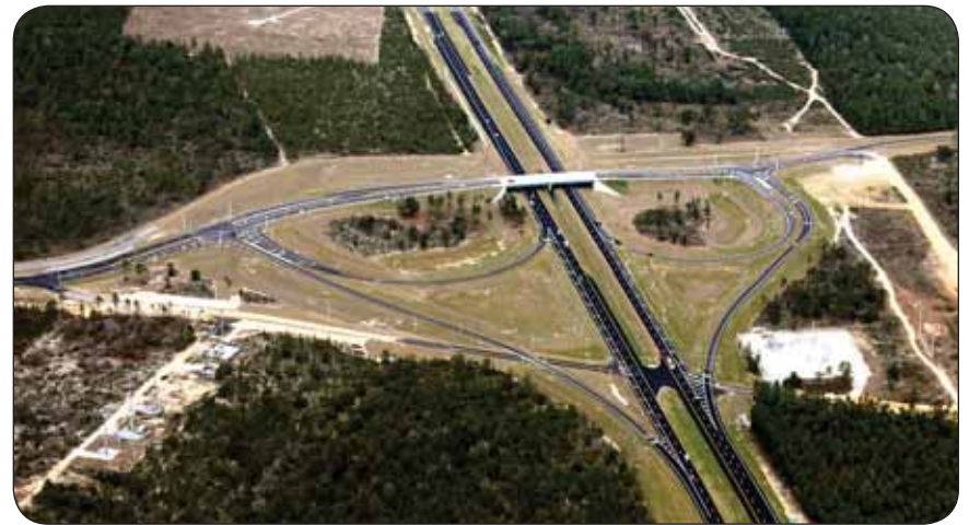
Intersection of SR-85 and West McWhorter Avenue — Outside Eglin Air Force Base, Florida