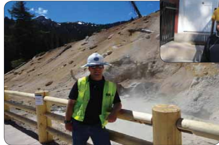
Onsite at Lassen Park Road, Lassen Volcanic National Park, California