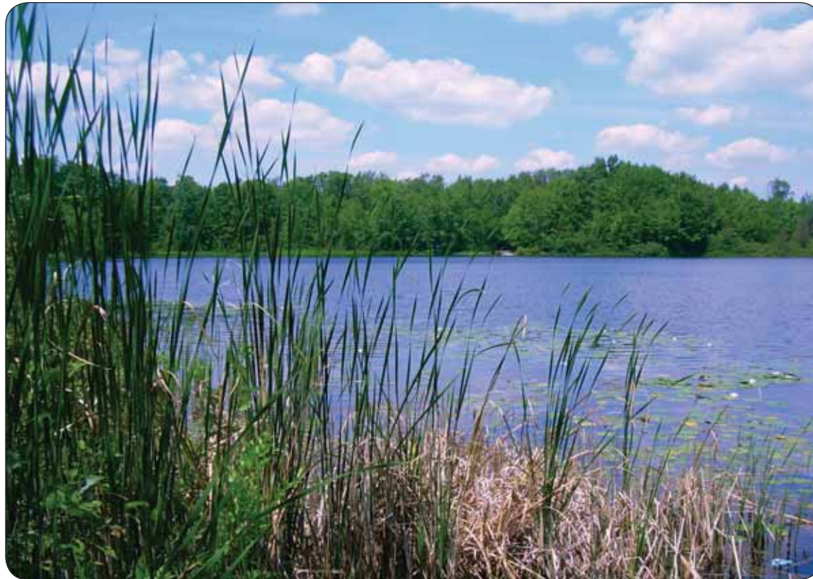
Restoring Stream Function & Fish Passage, Benton Lake, Manistee Forest, Michigan